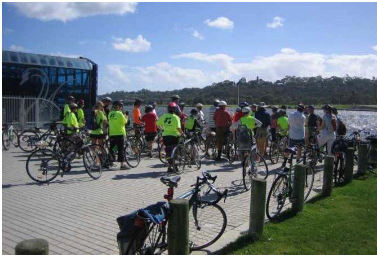
Admiring what's left of Mounts Bay