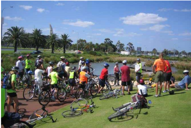
Point Fraser constructed wetland